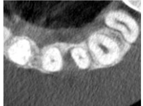
Another pre-operative CBCT scan.