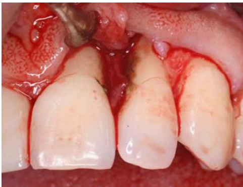
A view of the bone defect.