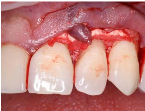
Collagen membrane placement.