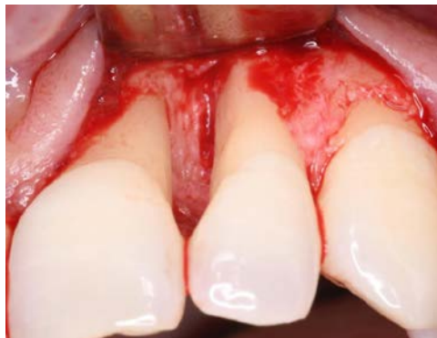
Post-degranulation and debridement view.