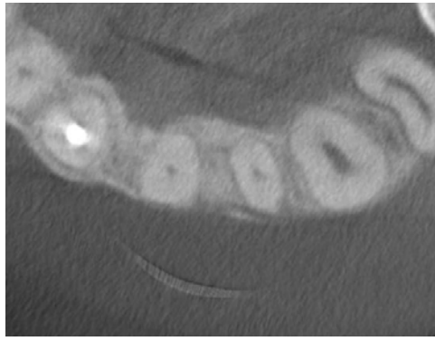
Another post-operative CBCT scan at 5 months.