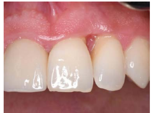
Post-operative view at 5 months.