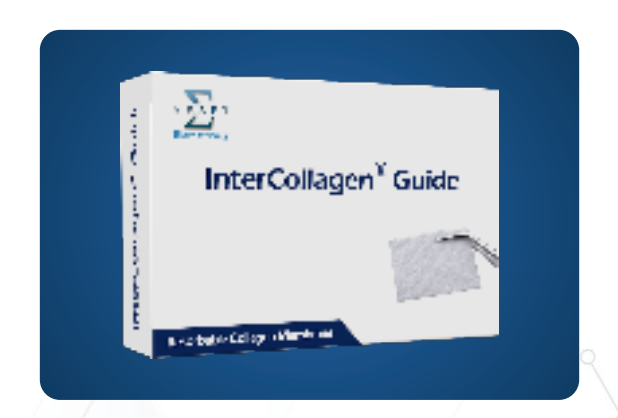
Resorbable Collagen Membrane

InterCollagen® Guide is a porcine-derived resorbable collagen membrane intended for periodontal and/or dental surgeries. When used in conjunction with a graft material for a guided bone regeneration procedure, the barrier membrane restricts the entry of rapidly proliferating non-osteogenic cells while allowing the ingrowth of slow-growing bone forming cells. InterCollagen® Guide can be easily sutured and trimmed to required size.