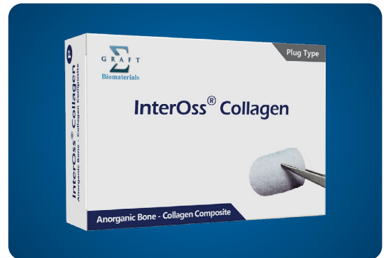
InterOss ® Collagen Plug-Type

InterOss ® Collagen is an anorganic hydroxyapatite-collagen composite for use in periodontal, oral and maxillofacial surgery. It is a combination of bovine bone granules and collagen fibers for exceptional handling. Its interconnected porous structure and osteoconductive property allows for the ingrowth of the adjacent viable bone while permitting easy exchange of body fluids. InterOss ® Collagen is available in various sizes in plug and block forms.